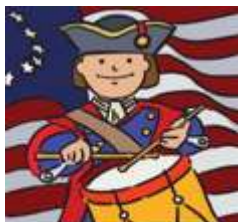
Happy 4th of July!